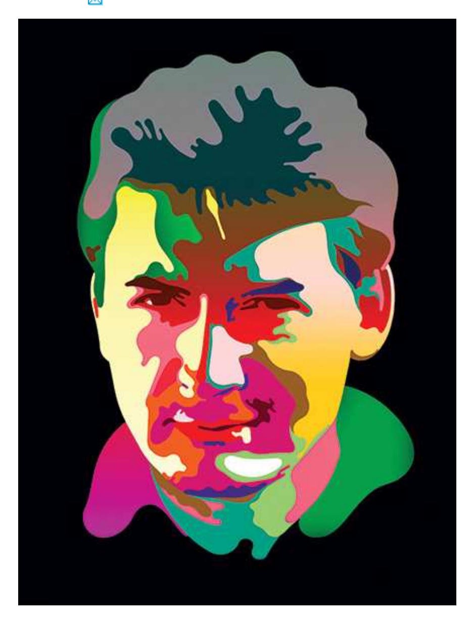
Illustration: Steven Wilson GET SMARTER: <u>12 Hacks That Will Amp Up Your Brainpower</u> 1: <u>Distract Yourself</u> 2: <u>Caffeinate With Care</u> 3: <u>Choose Impressive Information</u>